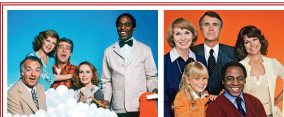
Guillaume starred on Soap, Benson and Sports Night (left to right), during which he had a stroke