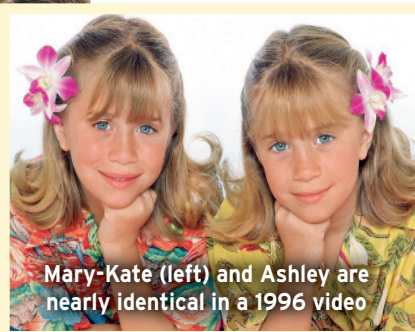
Mary-Kate (left) and Ashley are nearly identical in a 1996 video

BEING an Olsen twin may have been too much of a good thing. Now, Mary-Kate is sporting a new face and looks quite a bit different than sister Ashley – leading to speculation she's had a little work done!